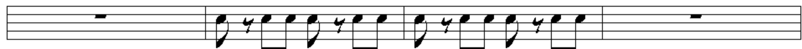
Ex.9 a basic ride