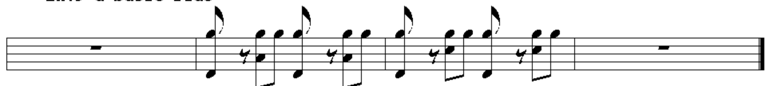
Ex.10 the basic ride on the cymbal on g - the snore on a - tha bass on d